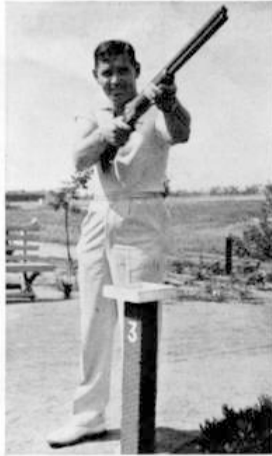
Clark Gable of film fame is now averaging 23 per round of Skeet. Gable takes his Skeet very seriously and has shot as many as thirty rounds in one day and never less than ten rounds. Has been shooting Skeet only six weeks but is fast approaching 25's era Class.